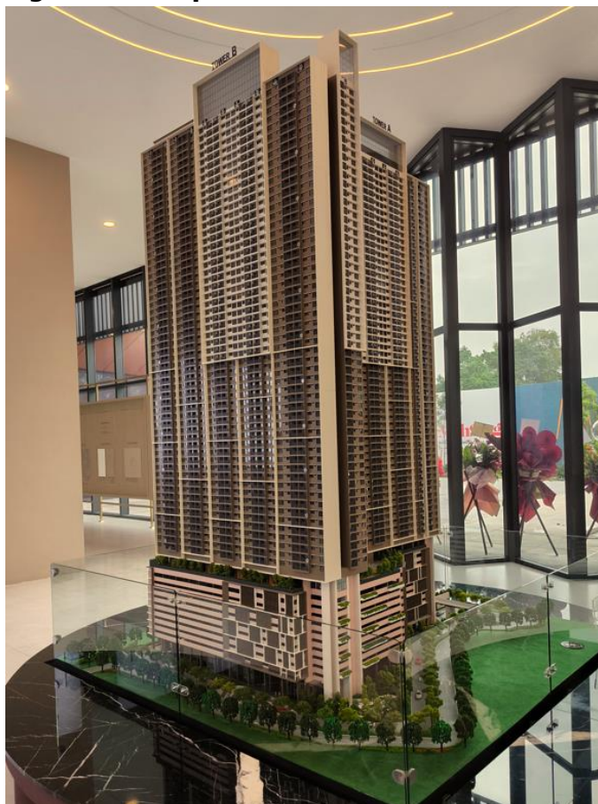
Figure 1: M Aspira Scale Model